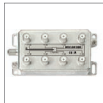
DM 06 B