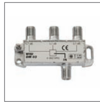
DM 03 A