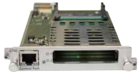
GT 42 W